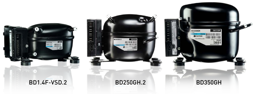
SECOP VARIABLE-SPEED DC-POWERED BD COMPRESSORS (BATTERY DRIVEN)