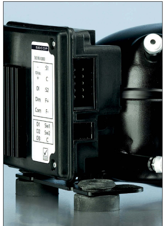
Fig.1 Compressor with DC electronic unit

Secop can accept no responsibility for possible errors in catalogues, brochures and other printed material. Secop reserves the right to alter its products without notice. This also applies to products already on order provided that such alterations can be made without subsequential changes being necessary in specifications already agreed. All trademarks in this material are property of the respective companies. Secop and the Secop logotype are trademarks of Secop GmbH. All rights reserved