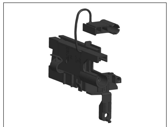
Fig. 3 KL-Series cable clamp 16058100, black