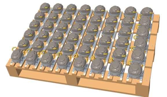
Fig. 1 One layer with an icreased quantity of 48 units

Each layer quantity will be increased from 40 compressors to 48 compressors per layer.