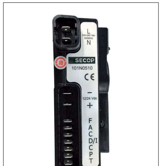
Fig.2 RoHS symbol on electronic unit (pin-out label)