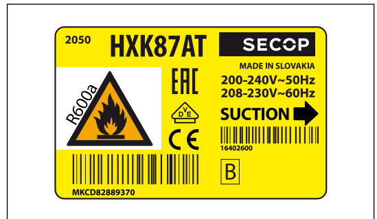
Fig. 2 New type label