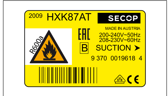
Fig. 1 Old type label

The type label modification doesn't affect any compressor approval certificates. Figure 1 shows the label as it looks today and figure 2 as it will look after the change. The type label for R134a does not have a warning sign but features a blue area instead.