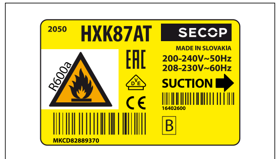
Fig. 2 New type label