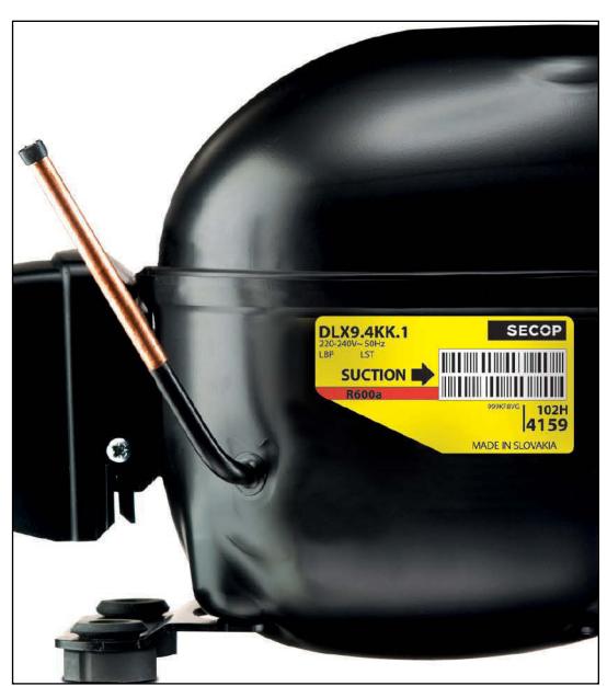
Fig.2 Compressor with new Secop type label

With more than 50 years of experience in compressor technology and highly committed employees, our focus is to develop and apply the advanced compressor technologies to achieve standard setting performance for leading products and businesses around the world.