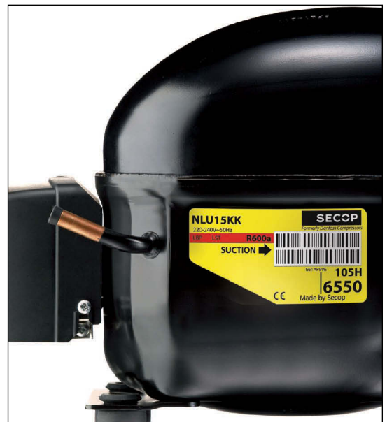
Fig.2 Compressor with new Secop type label

With more than 50 years of experience in compressor technology and highly committed employees, our focus is to develop and apply the advanced compressor technologies to achieve standard setting performance for leading products and businesses around the world.