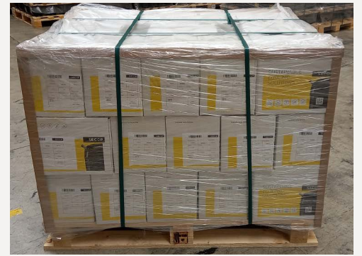
Fig.4 Pallet with 42 Single Packs (new layout)