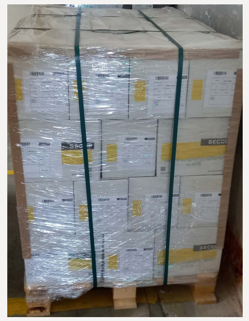
Fig.3 Pallet with 56 Secop Single Packs (old layout)

For any questions, please feel free to contact your personal Secop representative.