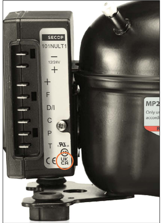
Fig.1 UKCA marking on a Secop controller label