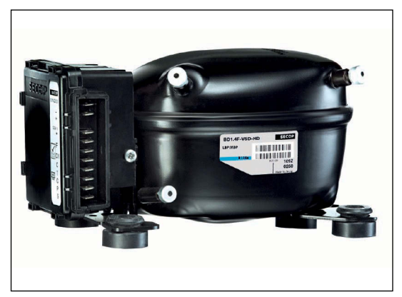
Fig.1 Secop BD1.4F-VSD-HD compressor with electronic unit

Please contact your usual Secop source for any further information.