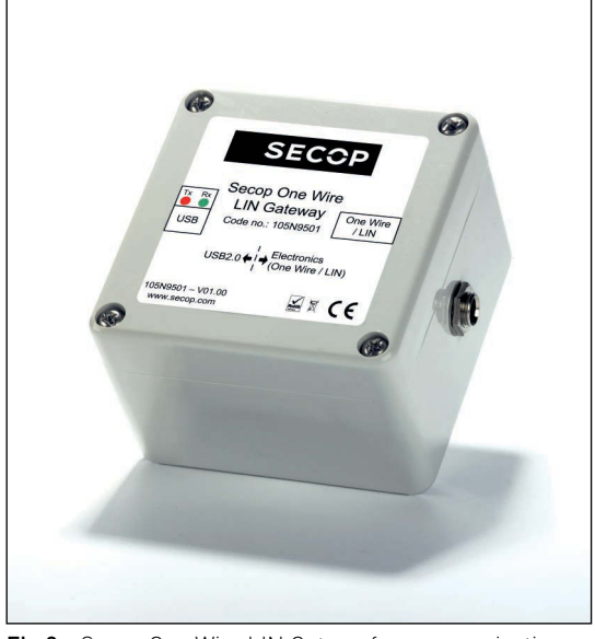
Fig.2 Secop One Wire LIN Gatway for communication with TOOL4COOL®