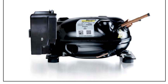
Fig. 1 XV compressor with electronic unit 105N5020/22.

Secop will be introducing the XV attached electronic unit with PFC to the market to comply with the latest EU standards.