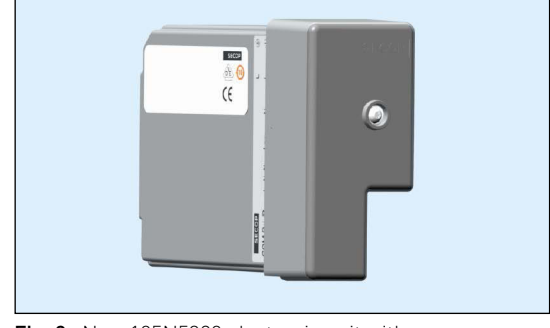
Fig. 3 New 105N5320 electronic unit with cover.

The Adaptive Energy Optimisation function (AEO) has been improved with a soft start-up after power on and a forbidden speed function that excludes a selectable speed range to prevent vibration noise in the refrigeration system. The selectable damping factor has been changed to 70% to offer robust speed regulation.