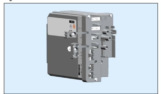
Fig. 4 New 105N5320 electronic unit without cover.

The new controller has a VDE certificate, and appliances being updated need to update the VDE certificates accordingly.