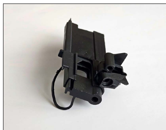
Fig. 3 K-Series cable clamp 16058100, black