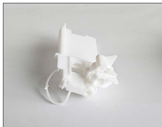
Fig. 2 K-Series cable clamp 11341000, white