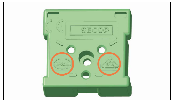
Fig. 3 After – relay 117U6...