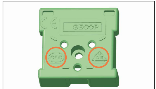
Fig. 3 After – relay 117U6...