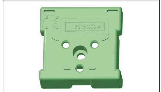
Fig. 1 Before – relay 117U6...

Please get in touch with your local Nidec GA Compressor contact person for more information.