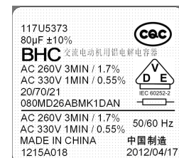
Fig. 2 BHC brand, China